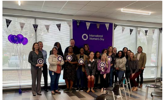
Our teammates had a great time at the watch party in Coppell, TX!

Thank you to everyone who attended and participated in this event, we appreciate your support!