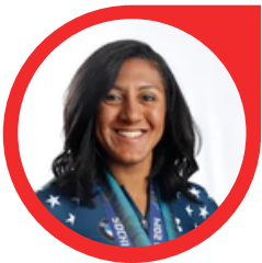
Elana Meyers Taylor

In 2015, Elana made history, becoming the first woman to earn a spot on the U.S. National Team competing with the men as a four-man bobsled pilot. She won the 2015 World Championships in the women's two-man event, the first woman in U.S. history to do so. Elana won two silver medals for bobsledding at the 2018 Winter Olympics, winning her second while injured.