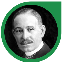
Daniel Hale Williams 1856-1931

Daniel Hale Williams was one of the first physicians to perform open-heart surgery in the United States. In May 1891, Williams opened Provident Hospital and Training School for Nurses, the nation's first hospital with a nursing and intern program that had a racially integrated staff.