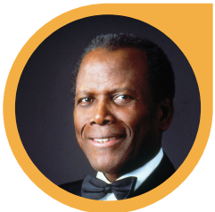
Sidney Poitier 1927-2022

"The world is going to tell you you can't, and you have to find a way to say you can anyways. You have to go after it, regardless of the circumstances put in front of you."