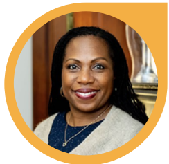
Ketanji Brown Jackson

"I have persistence in my DNA. There is absolutely nothing that I start that I don't want to finish. I gotta finish this."