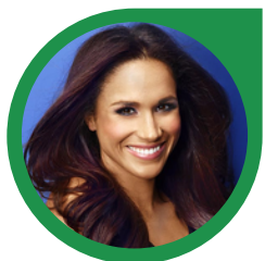
Meghan, Duchess of Sussex

"Be open to new ideas and experiences because you'll never know when someone else will have an interesting thought or when a new door will open to take you on the journey of your dreams."