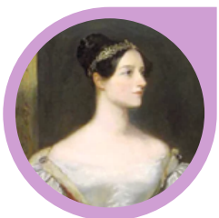
Ada Lovelace 1815 - 1852

"Women don't have to listen to their inner critic and hold themselves back; they can unleash themselves and reach their best potential if they put their effort into it. That is what I want my daughter to do."